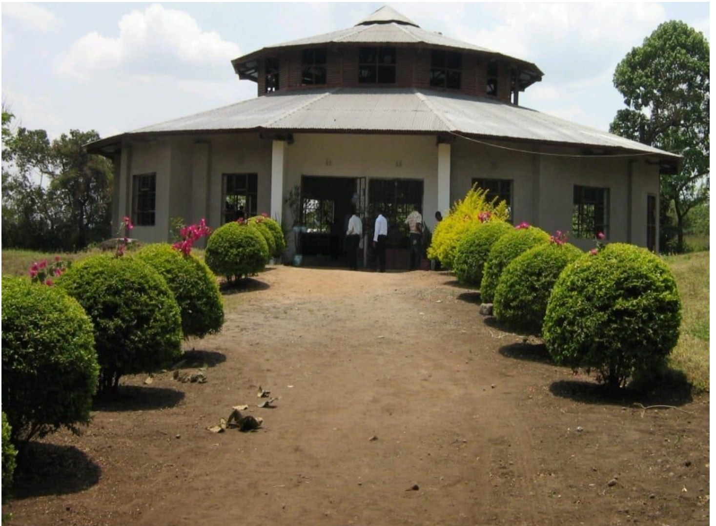
2. IMBASENI CENTRE