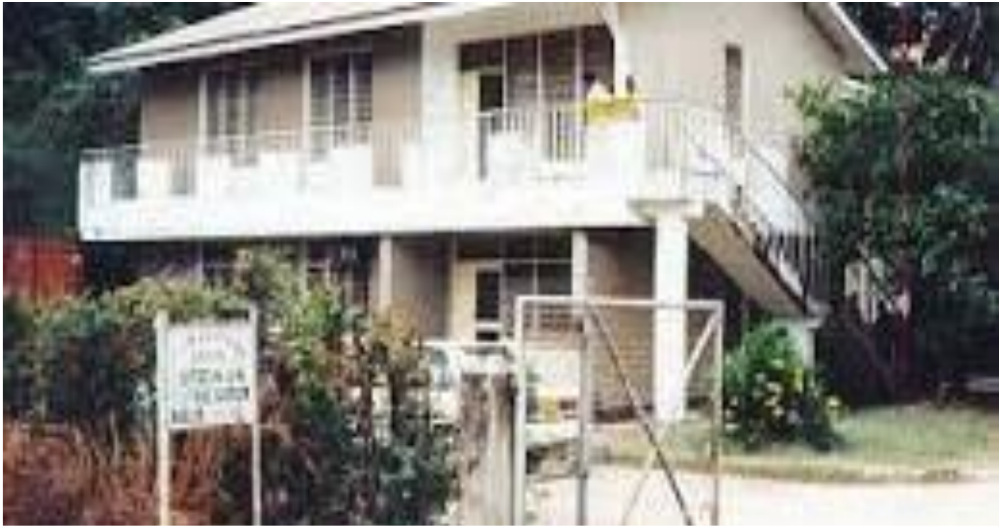
1. SCRIPTURE UNION HEAD QUARTER